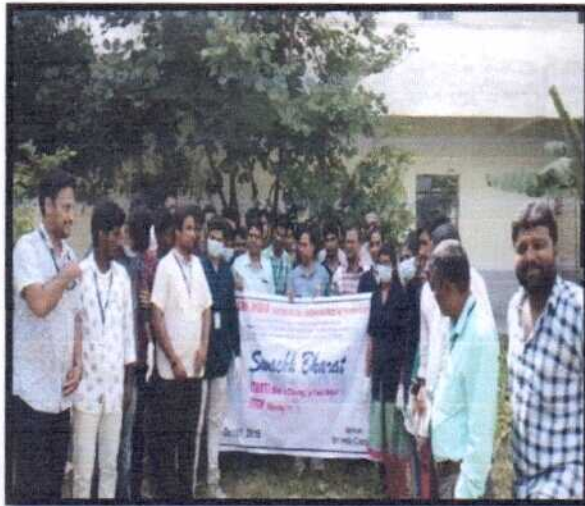
Swachh Bharath IN SIET

A clean India would be the best tribute India could pay to Mahatma Gandhi on his 150 birth anniversary in 2019,” said Shri Narendra Modi has launched the Swachh Bharat Mission at Rajpath in New Delhi. On 2nd October 2014, Swachh Bharat Mission was launched throughout length and breadth of the country as a national movement. While leading the mass movement for cleanliness, the Prime Minister exhorted people to fulfill Mahatma Gandhi’s dream of a clean and hygienic India. Shri Narendra Modi himself initiated the cleanliness drive at Mandir Marg Police Station. Picking up the broom to clean the dirt, making Swachh Bharat Abhiyan a mass movement across the nation, the Prime Minister said people should neither litter, nor let others litter. He gave the mantra of ‘Na gandagi karenge, Na karne denge.’ Shri Narendra Modi also invited eminent personalities to join the cleanliness drive and requested each of them to draw nine more into the initiative.