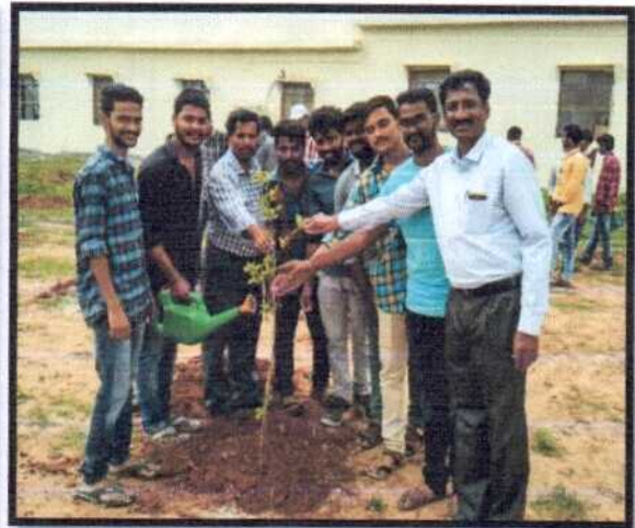
Tree plantation by the students