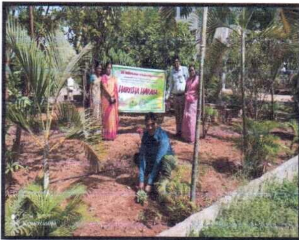
Tree plantation by the Principal

The main motto of this programme is sought to be achieved by a multi-pronged approach of rejuvenating degraded forests, ensuring more effective protection of forests against encroachment, fire, grazing and intensive soil and moisture conservation measures following the watershed approach.