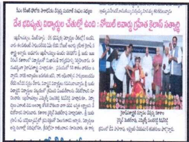
Enadu news paper 01.03.2018