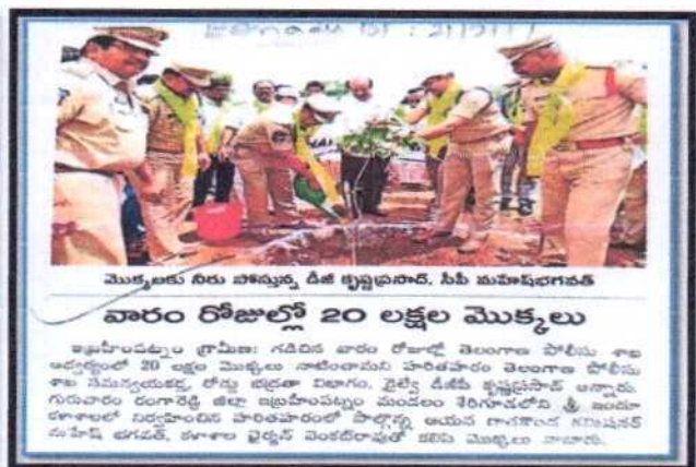
Enadu News Paper 21/7/2017

(Signature) PRINCIPAL Sri Indu Institute of Engineering & Tech. Sheriguda(V), Ibrahimpatnam(M), R.R. Dist. Telangana -501 510