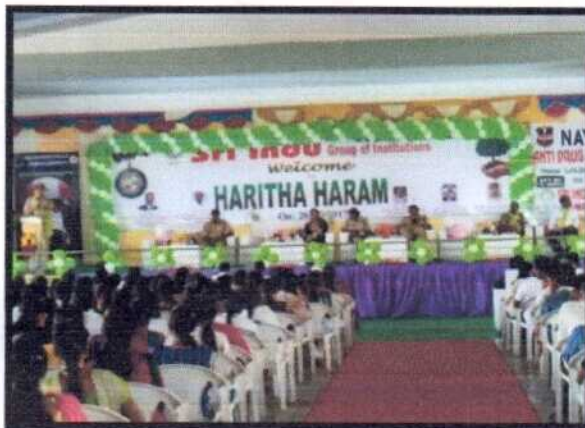
Awareness Programme on Harithaharam

In the areas outside the existing forest, massive planting activities were to be taken up in areas such as road-side avenues, river and canal banks, barren hills and foreshore areas, institutional premises, religious places, housing colonies, community lands, municipalities and industrial parks. The National Forest Policy of India envisages a minimum of 33% of the total geographical area under forest cover to maintain environmental stability and ecological balance, which is vital for the sustenance of all life-forms, be it human or animal.