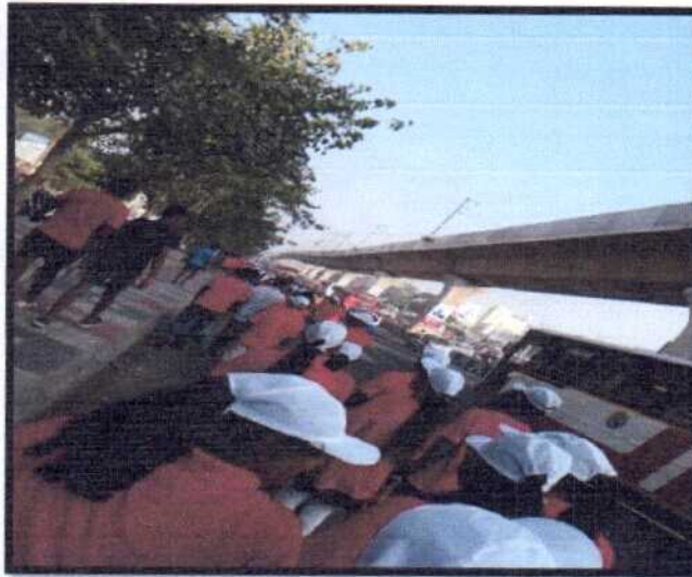
Student’s participation in the Rally

The main objective is to create awareness and remove the stigma and fear attached and help people recognize the early signs and symptoms of cancer, thus enabling them to seek treatment at an early stage, which echoes the idea of prevention is better than cure. An early detection helps patients to avoid further eventuality. 74 students participated in this programme.