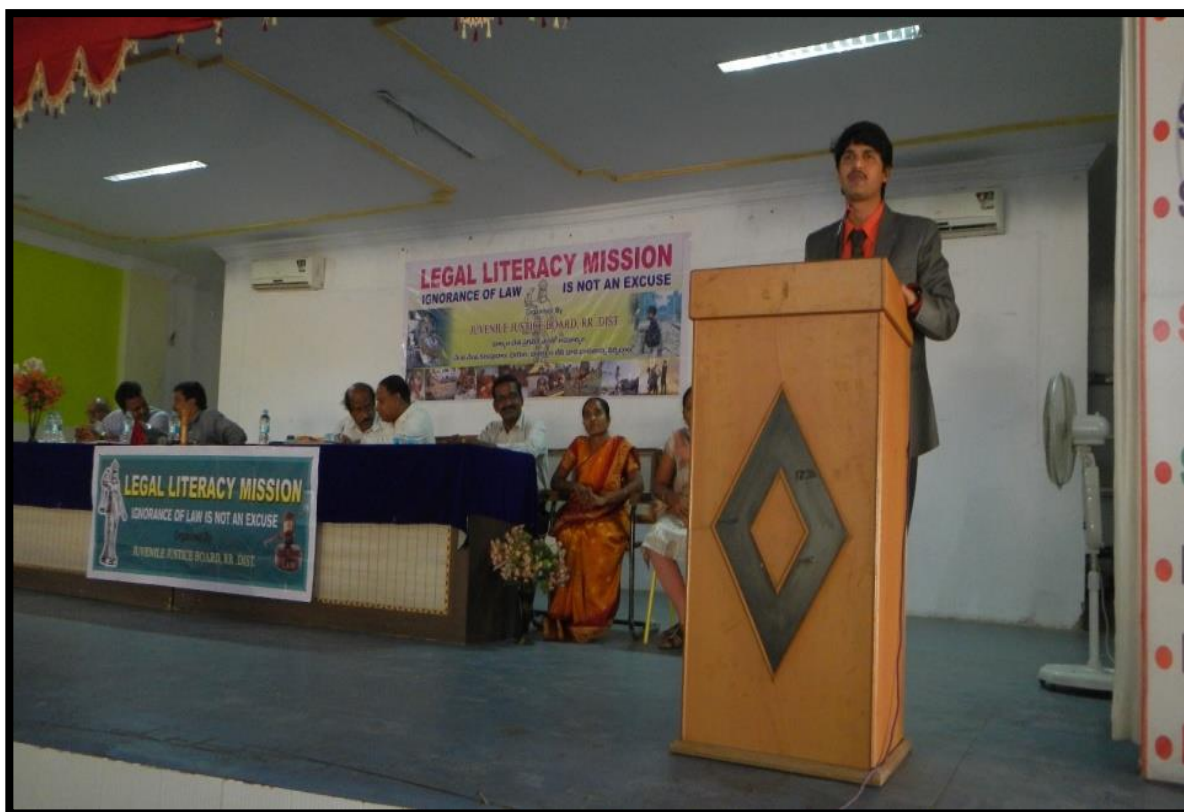
Speech about importance of Legal Rights

National Legal Services Authority (NALSA) has formulated National Plan of Action on spreading Legal Literacy across the country and launched the National Legal Literacy Mission for a period of 5(five) years i.e. 2005 to 09 at the National level in Delhi on the "6th day of March, 2006" in presence of the Hon'ble Prime Minister of India, the Hon'ble the Chief Justice of India and the Hon'ble Union Minister of Law and Justice.