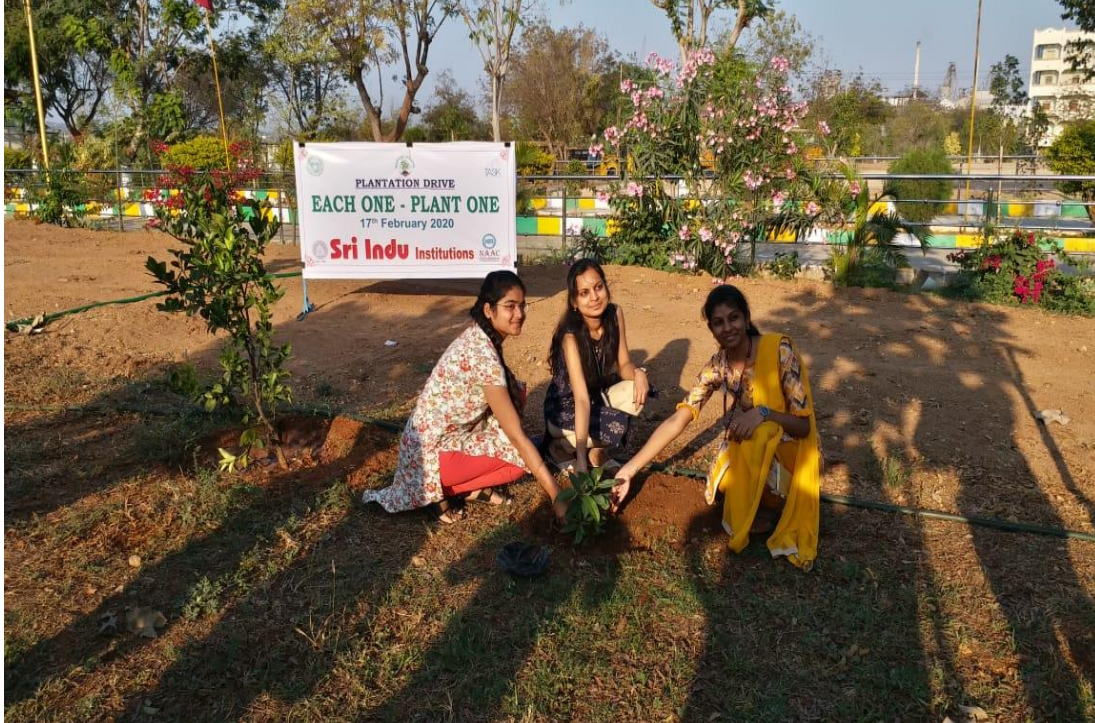
Sapling by the students.

In order to save environment, we have recently started a campaign under the caption - "Each one plant one". Under this programme the students were explained the importance of plants and their usefulness in our daily life. The students had brought the saplings and planted the saplings in the campus garden.