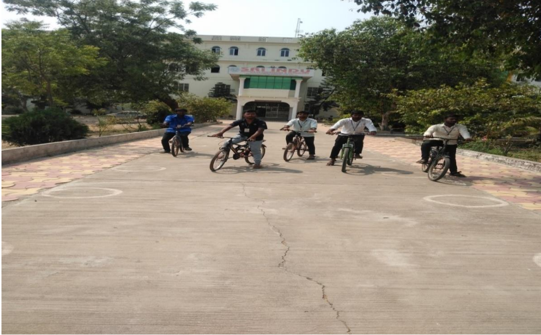
Students residing near college coming on cycles to college.

There is the usage of bicycles by most of the students and faculty who are living near to the college. This helps in reducing the emission of carbon dioxide obtained by vehicle usage.