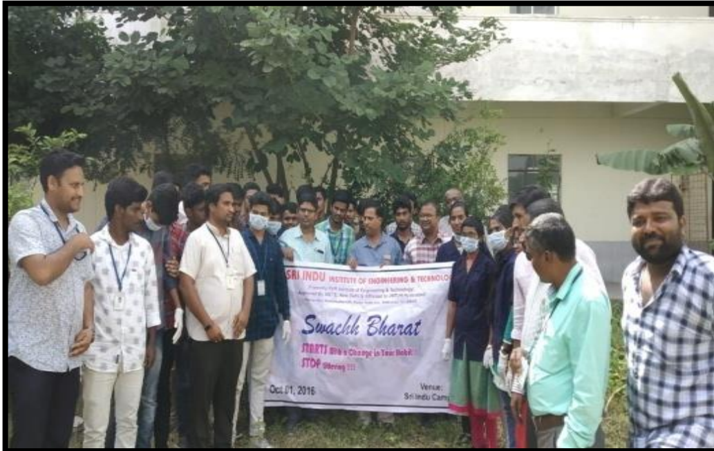
Swachh Bharath IN SIET.

Sri Indu Institute of Engineering & Technology – NSS Unit has organized “Swachh Bharath” event on 1 st October 2016. The NSS Student volunteers have visited our campus cleaned the nook and corner of the campus with the motto of ‘Use the dustbin, and please do not be mean and created awareness on cleanliness.