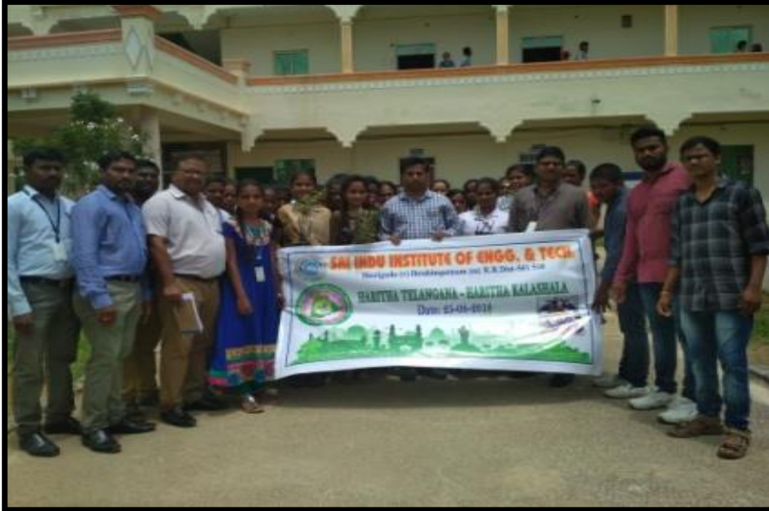
Haritha haram -haritha kalashala

Sri Indu Institute of Engineering and Technology – NSS cell organized HARITHA TELANGANA-HARITHA KALASHALA programme in our college on 25 th August, 2018. All the HODs, teaching, non teaching staff and students participated in this programme.