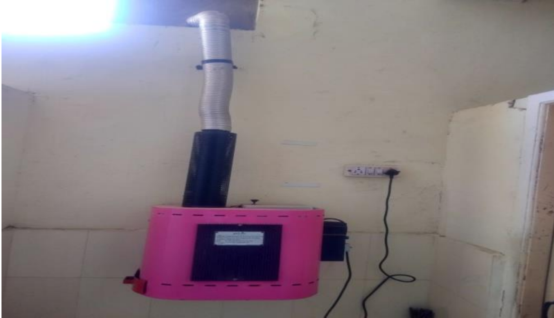
The college has the facility of Sanitary napkins incinerator.

Our institute encourages sanitary napkin disposing needs, here the used napkins is converted into a sterile ash. It helps to destroy used napkins in a scientific and hygienic way so, it is very suitable for all ladies toilets to get a pollution free hygienic environment.