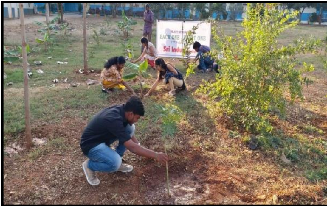
Planting of trees by students.