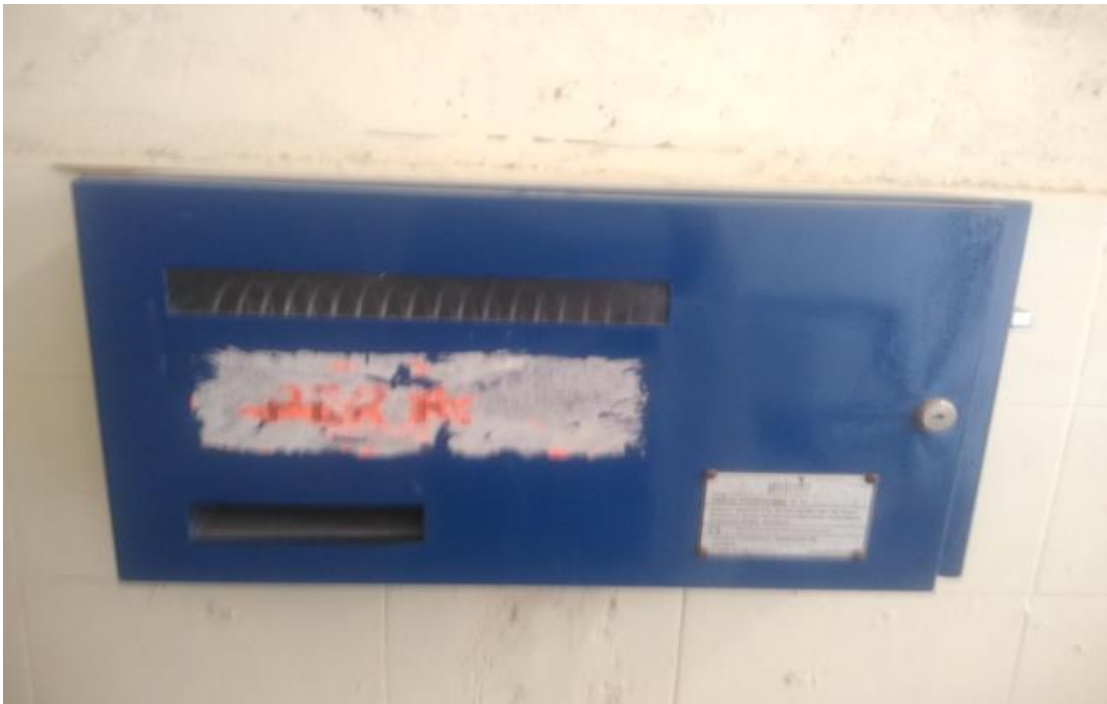
The college has the facility of Sanitary napkins wending machine.