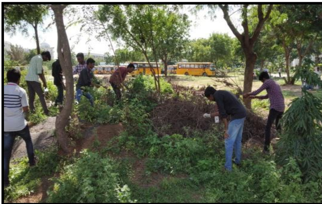
Students participation in Cleaning of the campus.