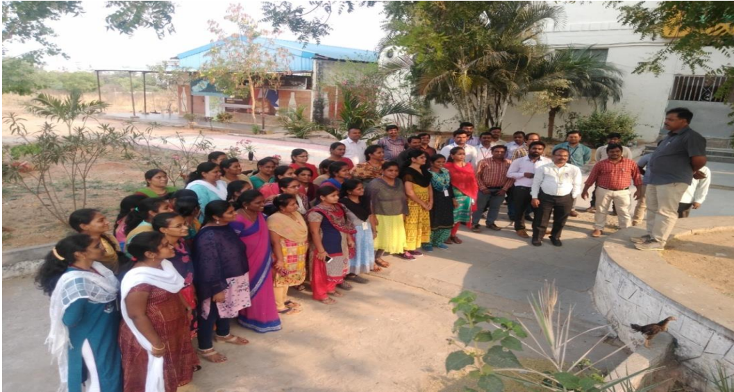
Our superior gives the speech on importance of environment.

It means educating people about ecology. It is necessary to decrease the harm to nature by human activities. Moreover, Environmental awareness serves as an idea that enables humans across the region to understand the economic, exquisite, and biological importance of the environment and how to protect and preserve them by eliminating human activities.