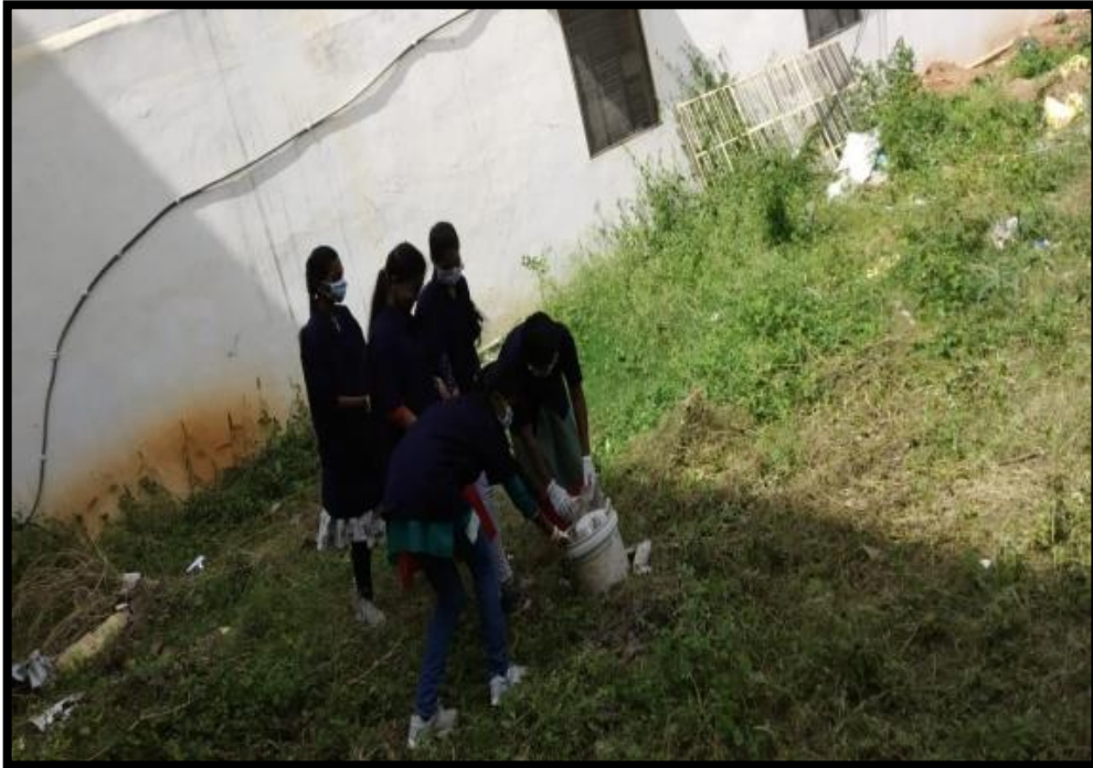
swachh bharath program.