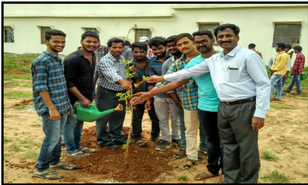
Tree plantation by the students.