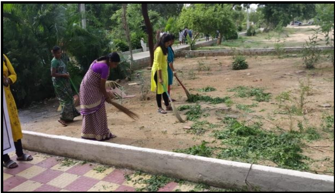
Active participation of students in Cleanness Drive.