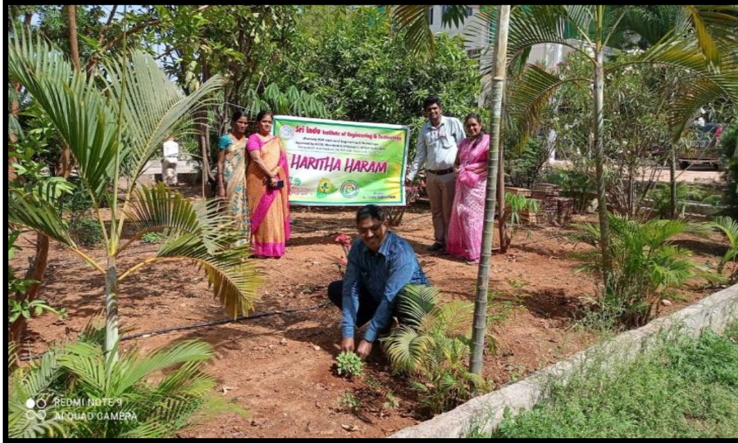
Tree plantation by the Principal.