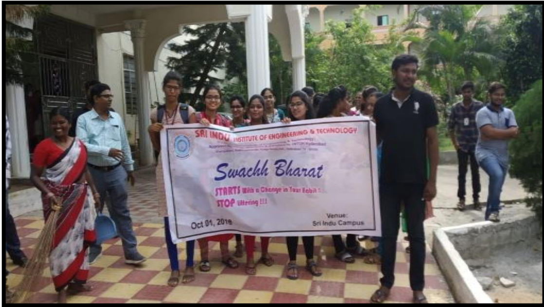
Swachh bharaoh program in the presence of honorable principal.

Sri Indu Institute of Engineering & Technology – NSS Unit has organized “Swachh Bharath” event on 1 st October 2018. The NSS Student volunteers have visited our campus cleaned the nook and corner of the campus with the motto of Save the environment & Reduce global warming and created an awareness on cleanliness.