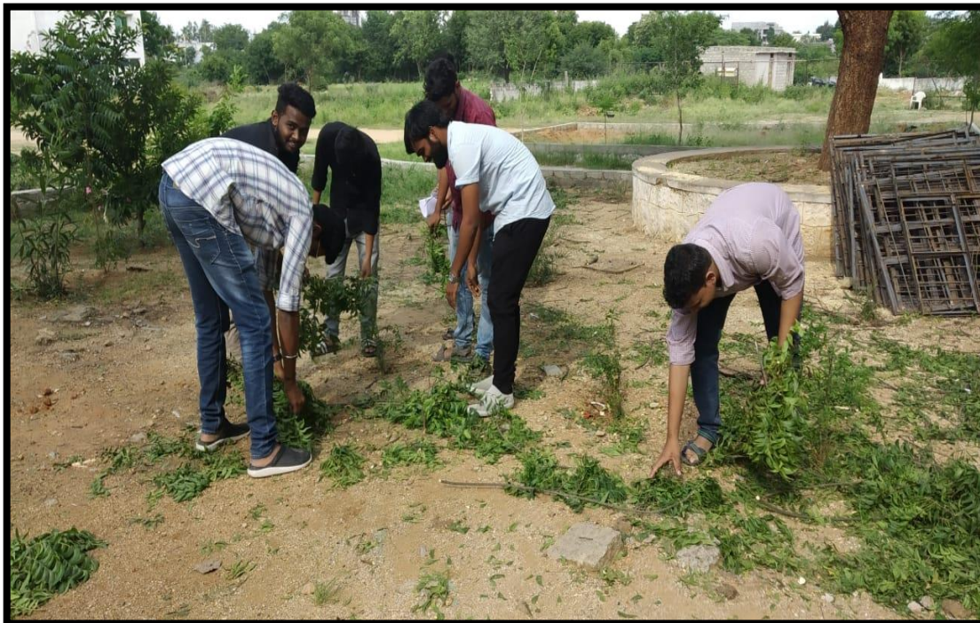
Waste Cleaning by the students.