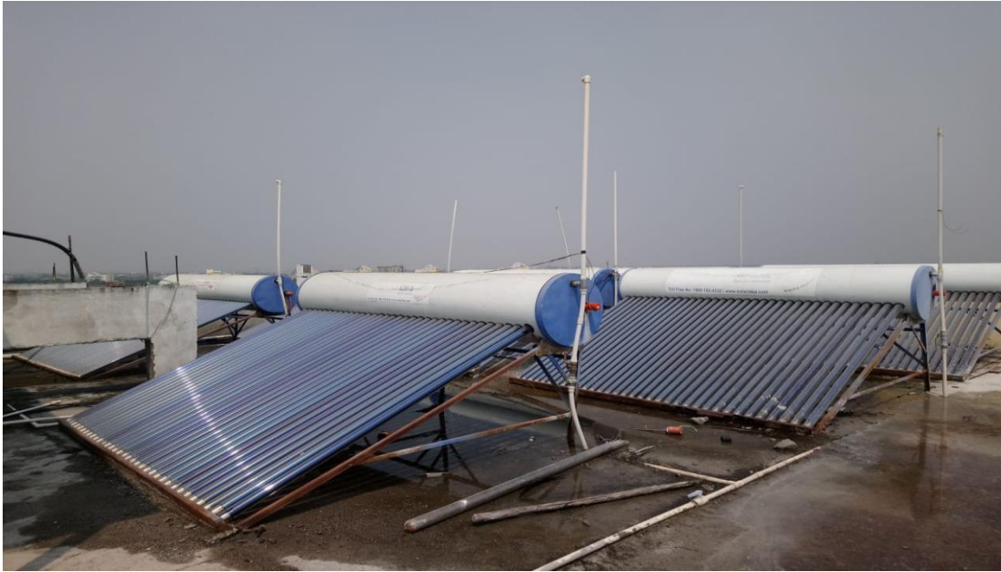
Array of solar panels installed on rooftop of college hostel building.

Array of solar panels installed on rooftop of college hostel building. It is part of solar system to provide hot water and is one of the major alternate sources of energy, which results in saving electricity a scarce resource in our country.