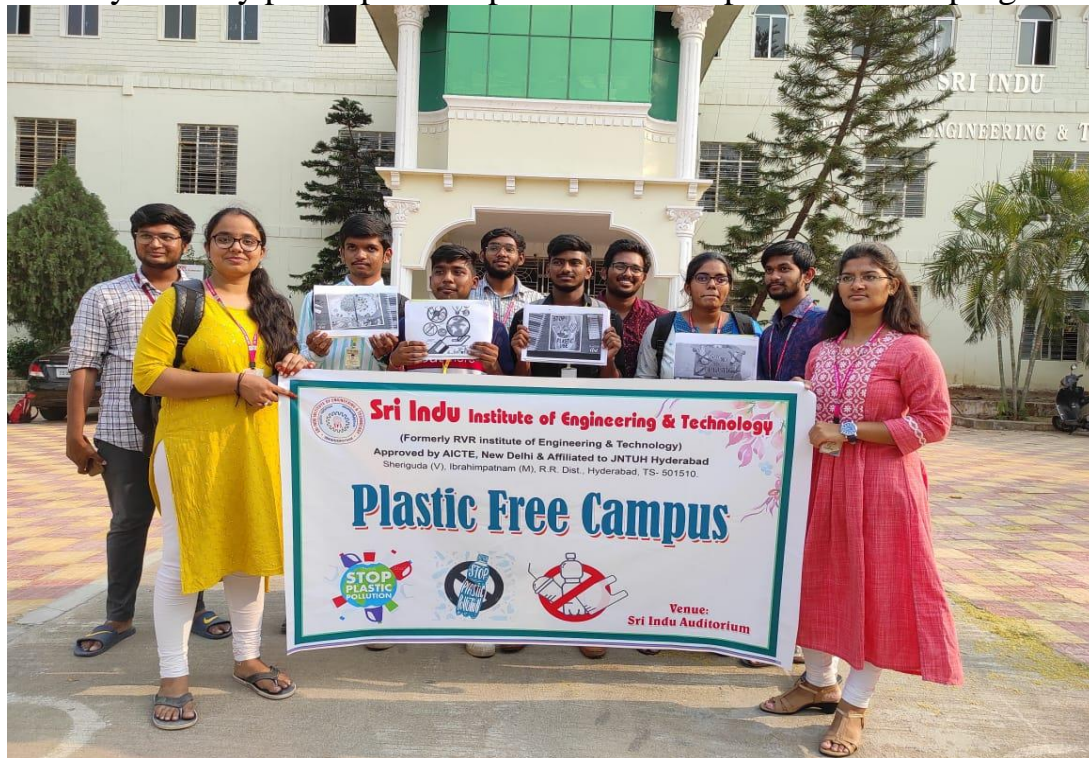
Students actively participated in plastic free campus awareness program.