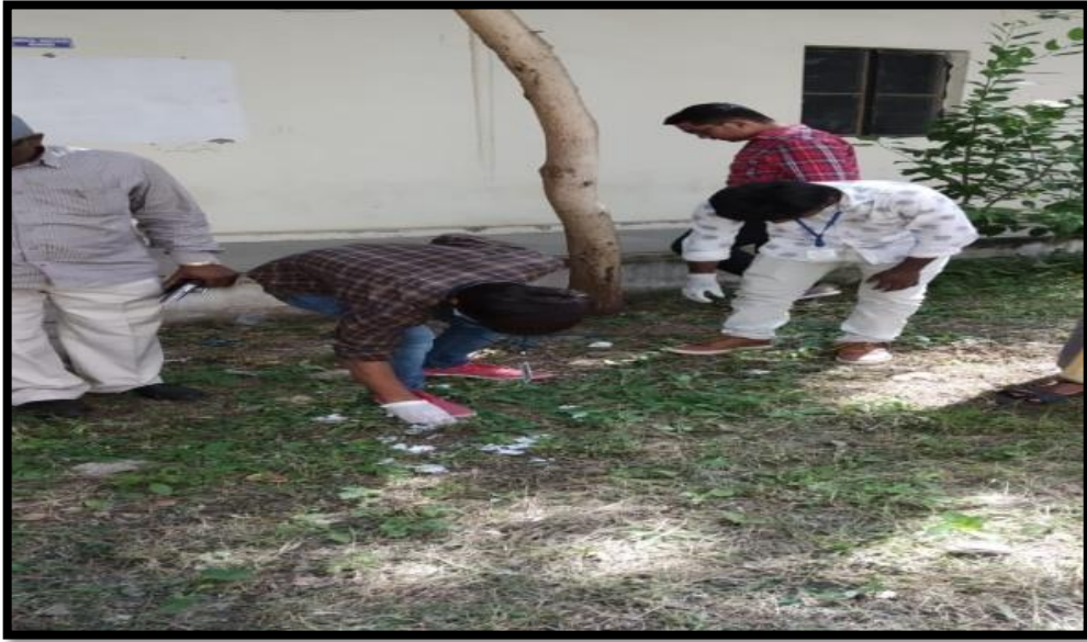
Students active participation in swachh bharath program.

Sri Indu Institute of Engineering & Technology – NSS cell has organized “Swachh Bharath” event on 10 th feb 2020 in nomula village. NSS Student volunteers have visited our campus and cleaned entire campus with the motto of save the environment and created awareness on tidiness .All HODs, teaching, technical staff and students have participated in this program.