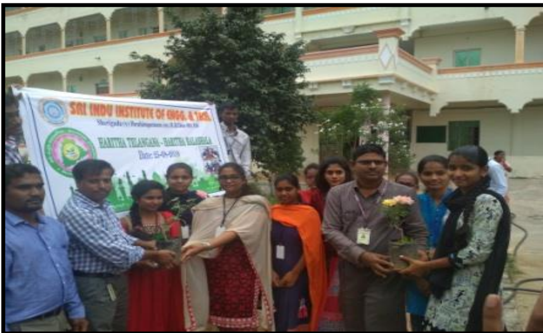
Distribution of Saplings