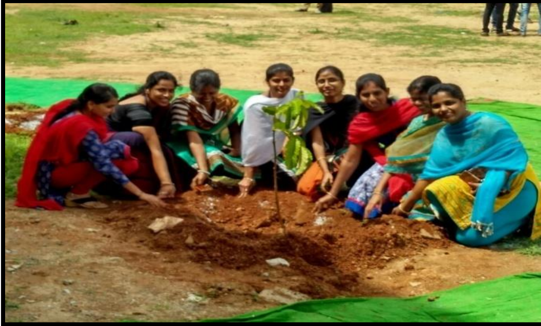
Sapling by the students.