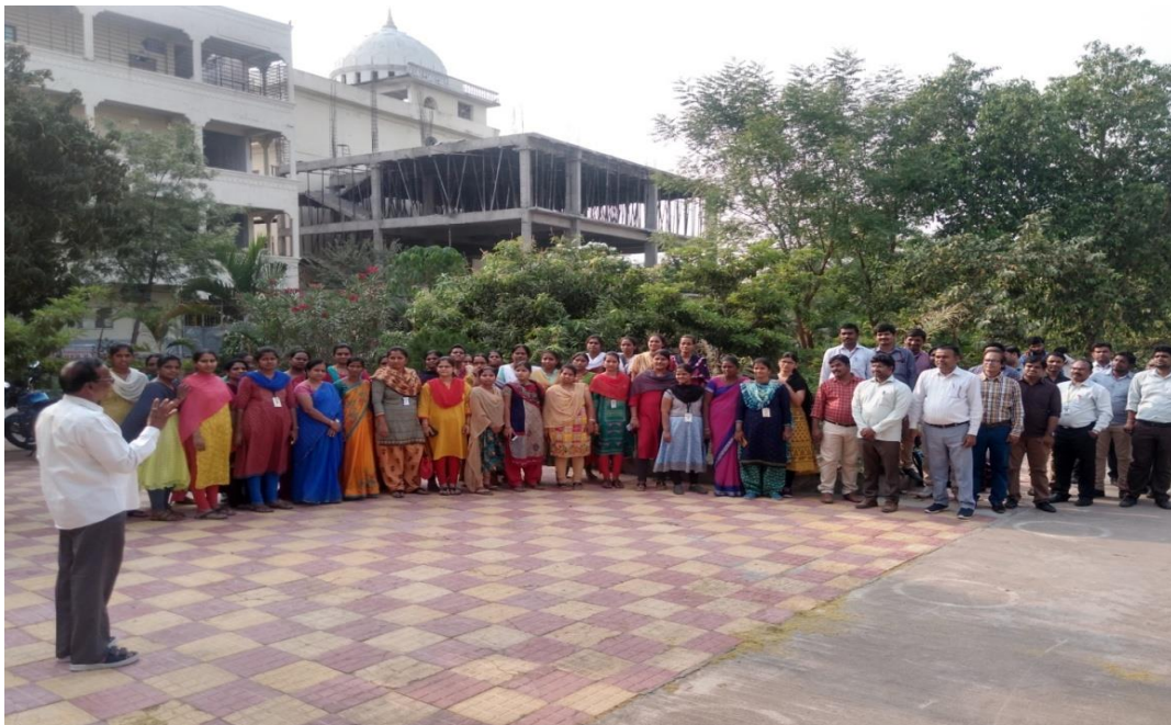
All the faculty members are participated in environmental awareness program.