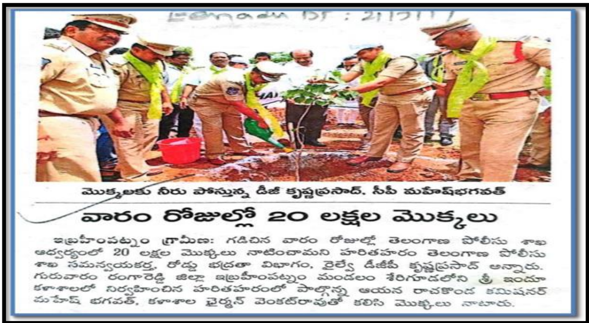
Enadu News Paper 21/7/2017