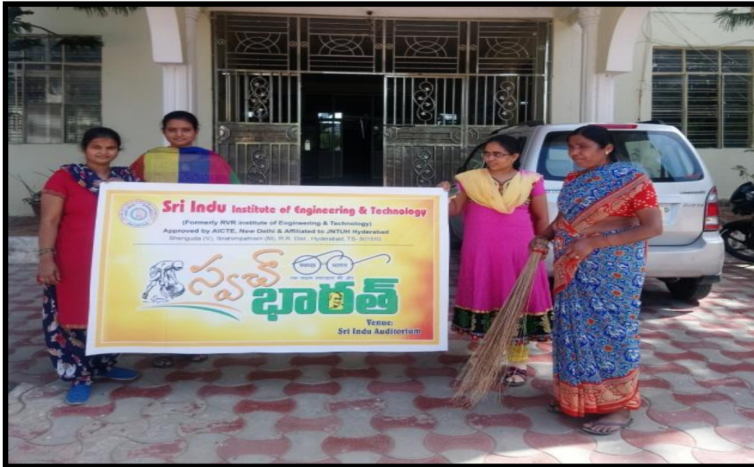
Swachh Bharath in SIET.

Sri Indu Institute of Engineering and Technology under the aegis of the National Service Scheme (NSS) cell has organized on 6 th , October 2015 the Swachh Bharath i.e., the Cleanliness Drive for the creation of hygienic environment in the society.