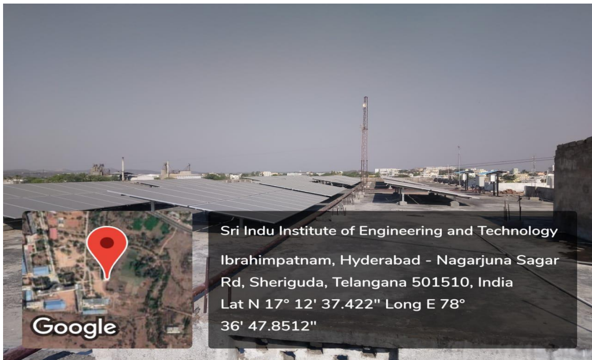
Array of solar panels.

The college efficiently using solar energy by installing solar panels on roof of building and it produces 75kwp.