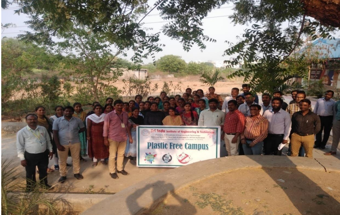
Faculty actively participated in plastic free campus awareness program.

The institution discourages the usage of plastic bags and cups within the premises. There was a strict rule from the institute to use only steel plates or leaf plates and steel cups or paper cups. Even the faculty in the college prefers to use steel water bottles instead of plastic water bottles.