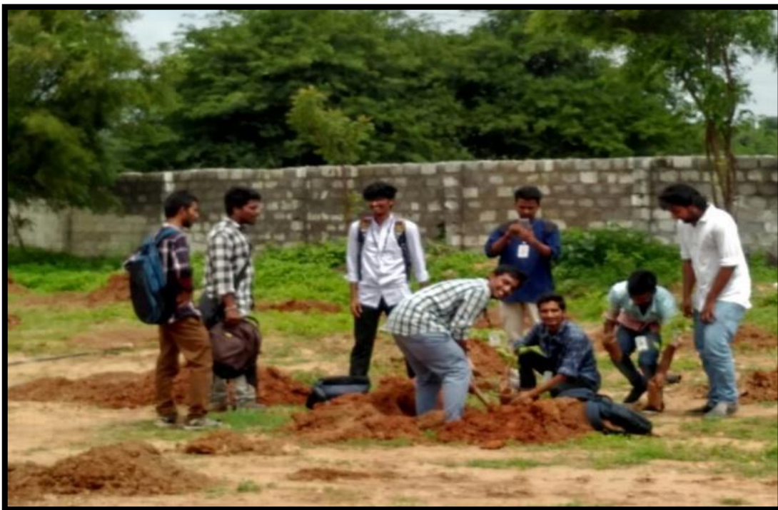
Active participation of the students.