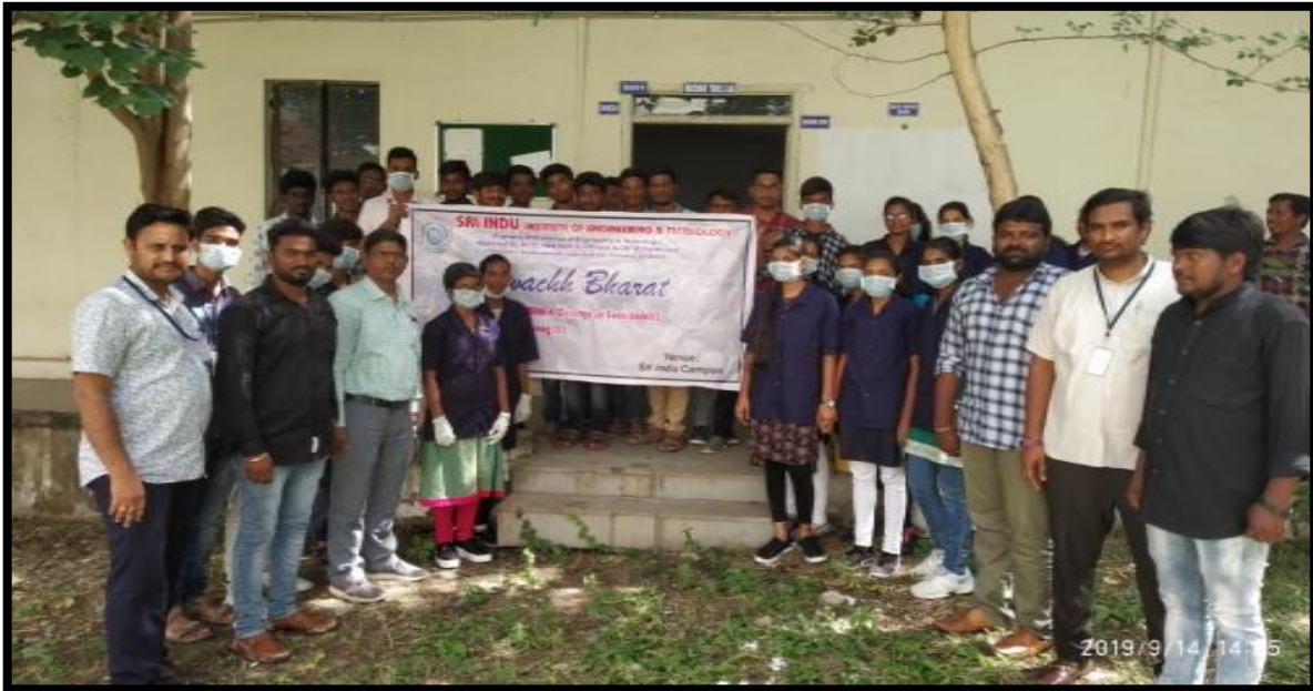
Active participation of faculty and students in Swachh Bharath program.

Sri Indu Institute of Engineering & Technology – NSS Unit has organized “Swachh Bharath” event on 3 rd October 2017. The Students of SIET have participated our campus cleaned the nook and corner of the campus with the motto of “To save the environment, reduce global warming” and created an awareness on cleanliness.