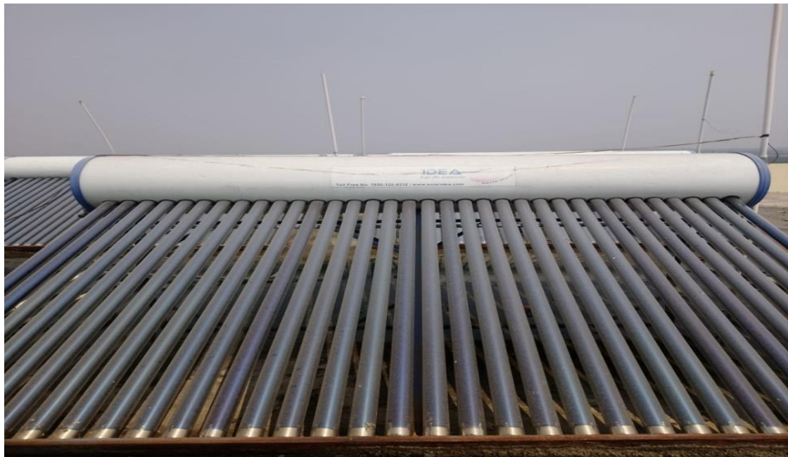
Solar water heater.