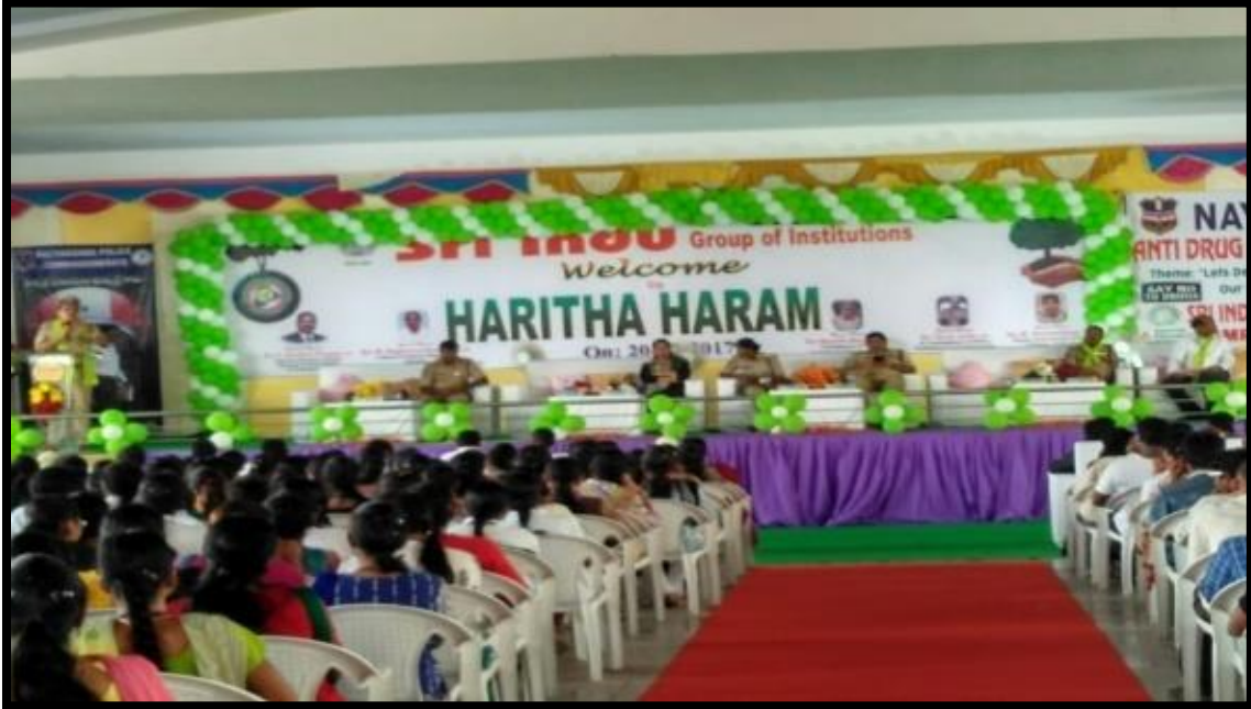
Awareness Programme on Harithaharam.