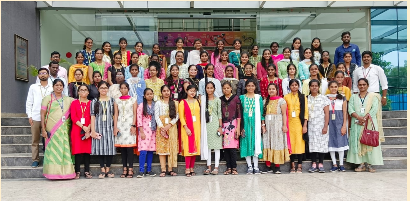
INDUSTRIAL VISIT (NATIONAL REMOTE SENSING CENTRE)