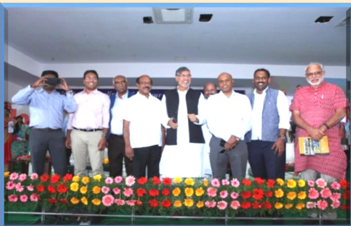
NOBEL LAUREATE SHRI KAILASH SATYARTHI