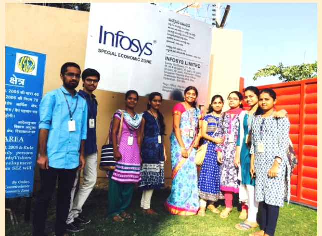
PLACEMENT DRIVE AT INFOSYS CAMPUS