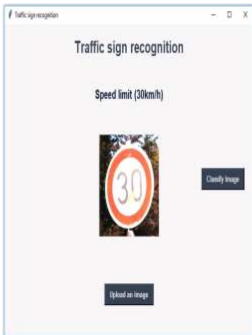
Fig. Output of traffic sign