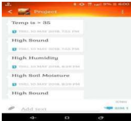
Message with Location when Temperature crosses limited.