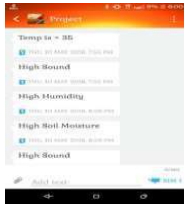
Screenshot of message if it crosses the limit.