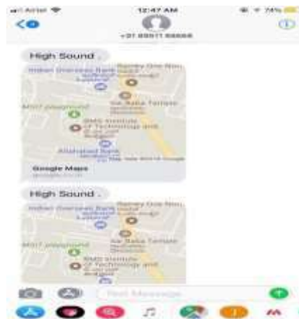
creenshot of message with location when thereis high sound.