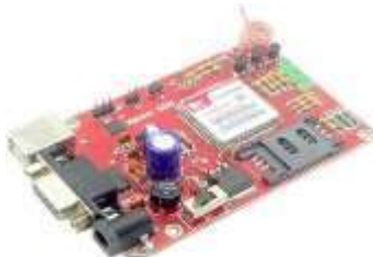
GSM SIM 900A

115200 through AT command. The GSM/GPRS Modem is having internal TCP/IP stack to enable you to connect with internet via GPRS. It is suitable for SMS, Voice as well as data transfer application in M2M interface. The onboard Regulated Power supply allows you to connect wide range unregulated power supply . Using this modem, you can make audio calls, SMS, Read SMS, attend the incoming calls and internet through simple AT commands.