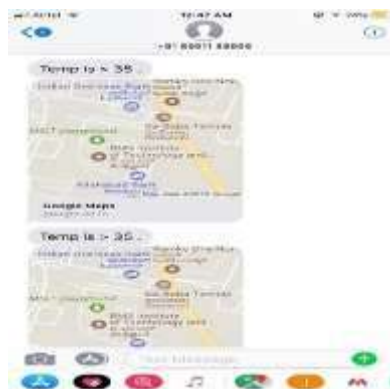
Message with Location when Temperaturecrosses limited.