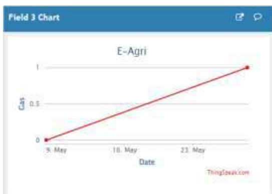
Fig: Output of the gas sensor on the web