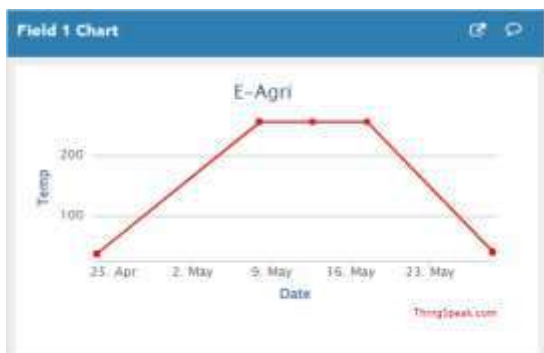
Fig: Output of temperature sensor on the web