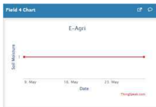
Fig: Output of light sensor on the web