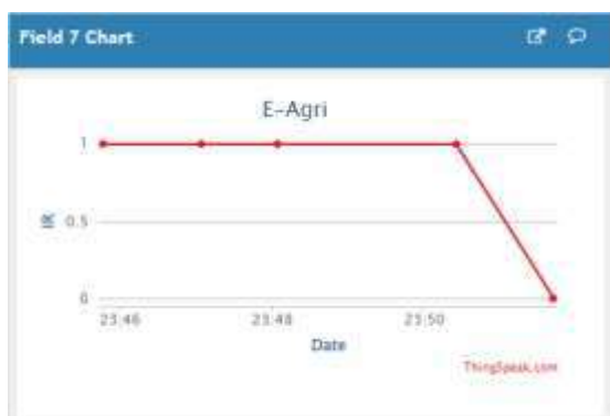
Fig: output of humidity sensor on the web