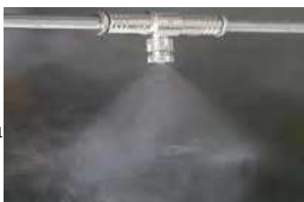
Fig 2: Spray Mister