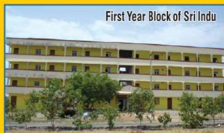
First Year Block of Sri Indu