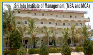
Sri Indu Institute of Management (MBA and MCA)