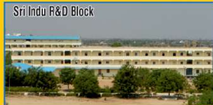
Sri Indu R&D Block