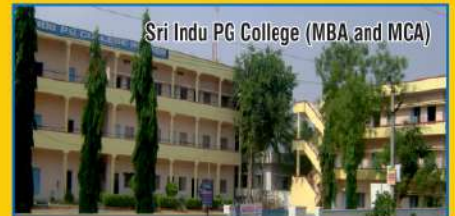
Sri Indu PG College (MBA and MCA)