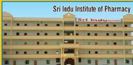
Sri Indu Institute of Pharmacy