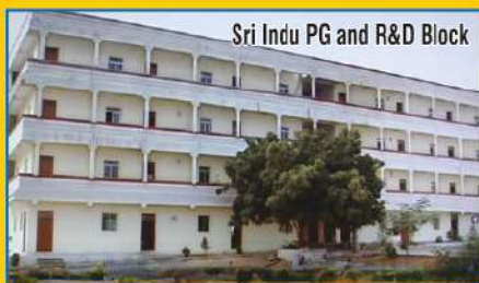
Sri Indu PG and R&D Block