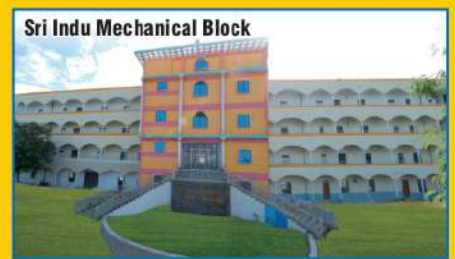
Sri Indu Mechanical Block