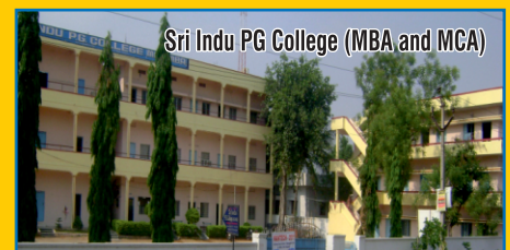
Sri Indu PG College (MBA and MCA)