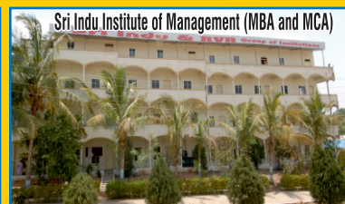
Sri Indu Institute of Management (MBA and MCA)