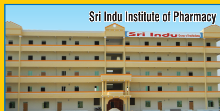
Sri Indu Institute of Pharmacy