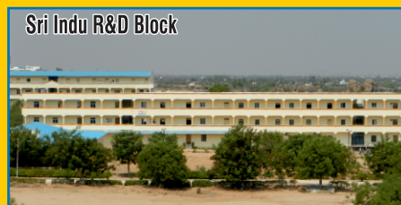
Sri Indu R&D Block