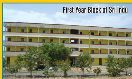
First Year Block of Sri Indu