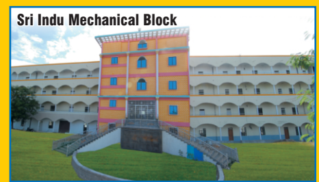
Sri Indu Mechanical Block