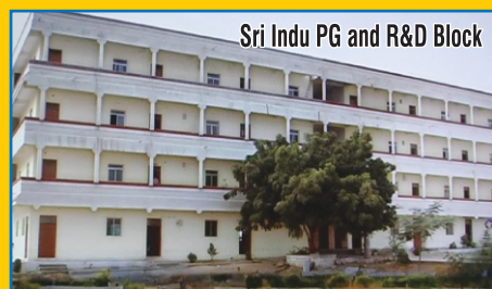
Sri Indu PG and R&D Block