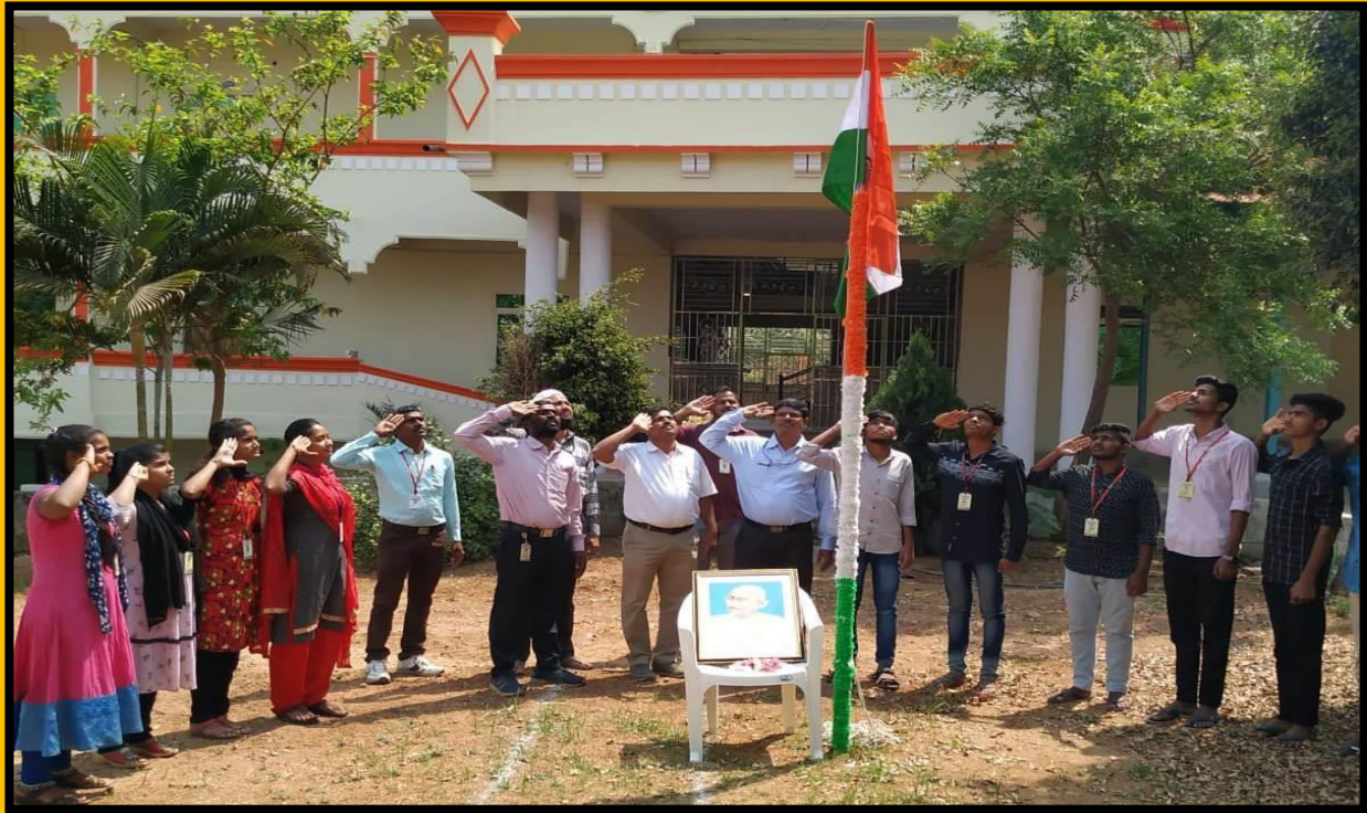
REPUBLIC DAY CELEBRATIONS