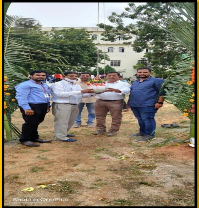
Pongal in College