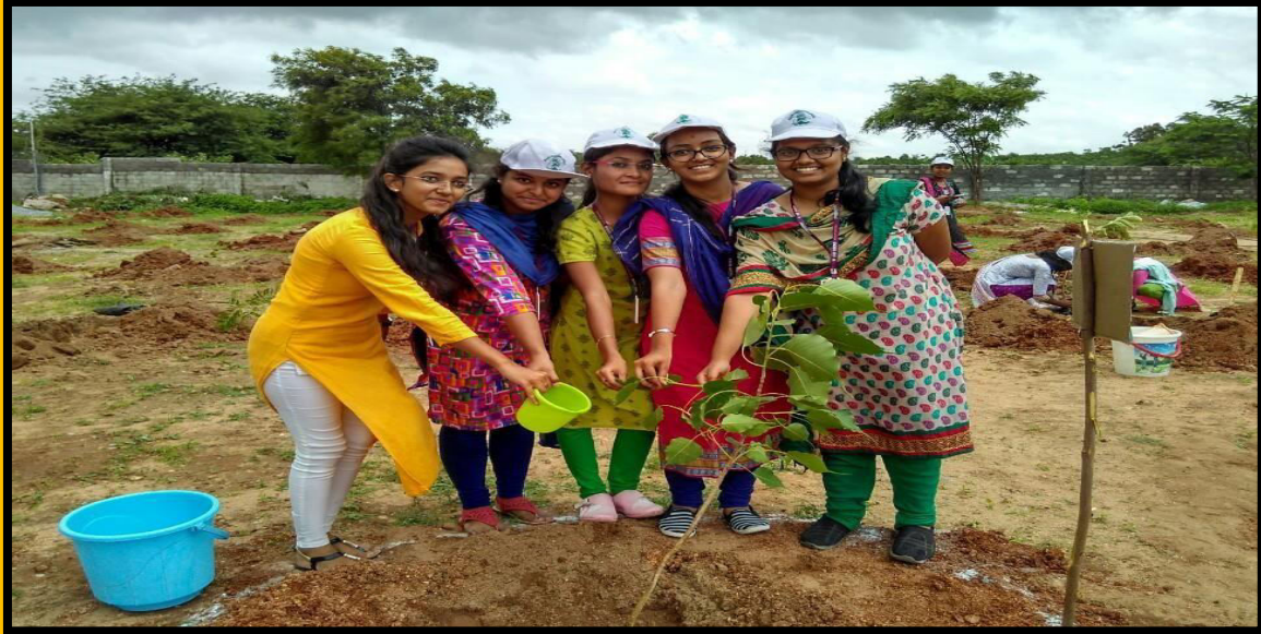
Celebrated World Earth Day in College on 22 nd April, 2021