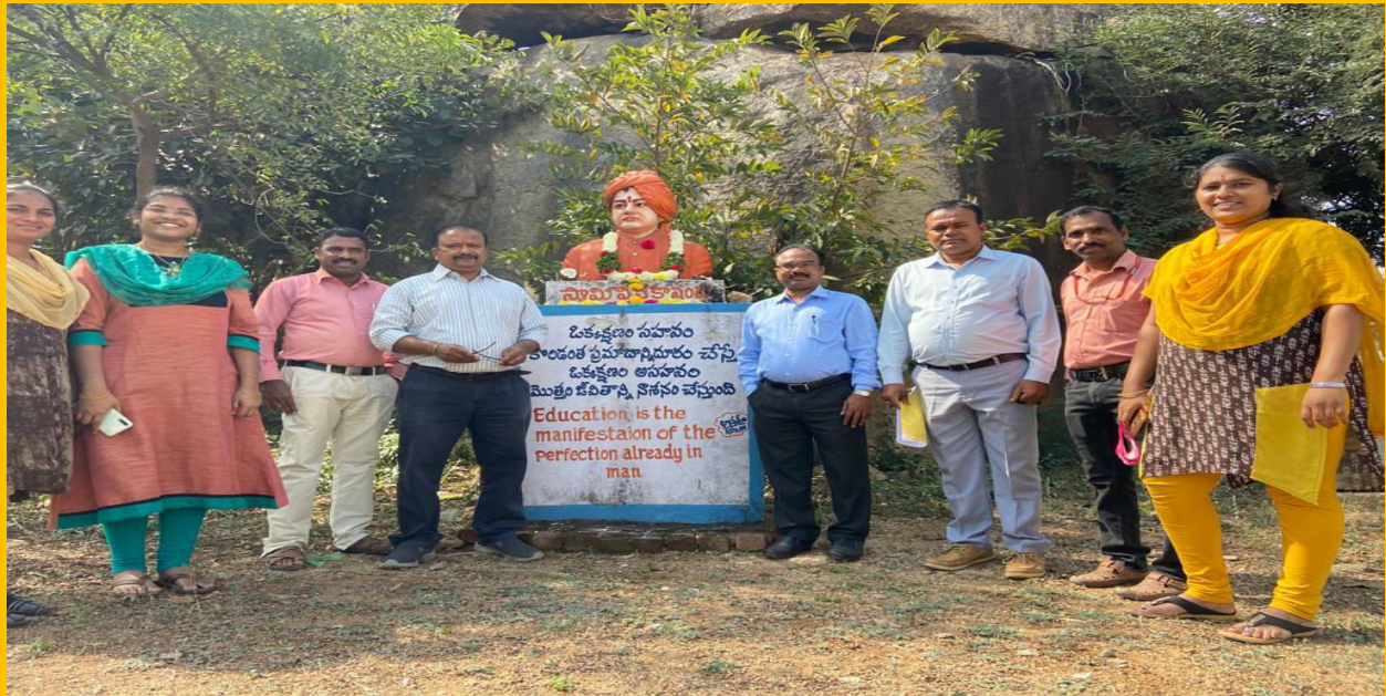
Celebrated Vivekananda Birthday on 12th June 2021