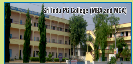
Sri Indu PG College (MBA and MCA)