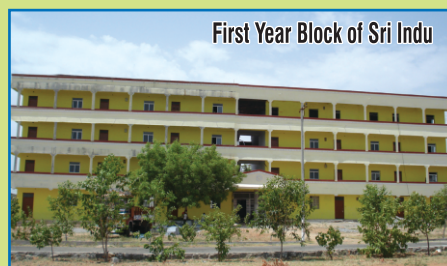
First Year Block of Sri Indu