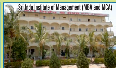
Sri Indu Institute of Management (MBA and MCA)